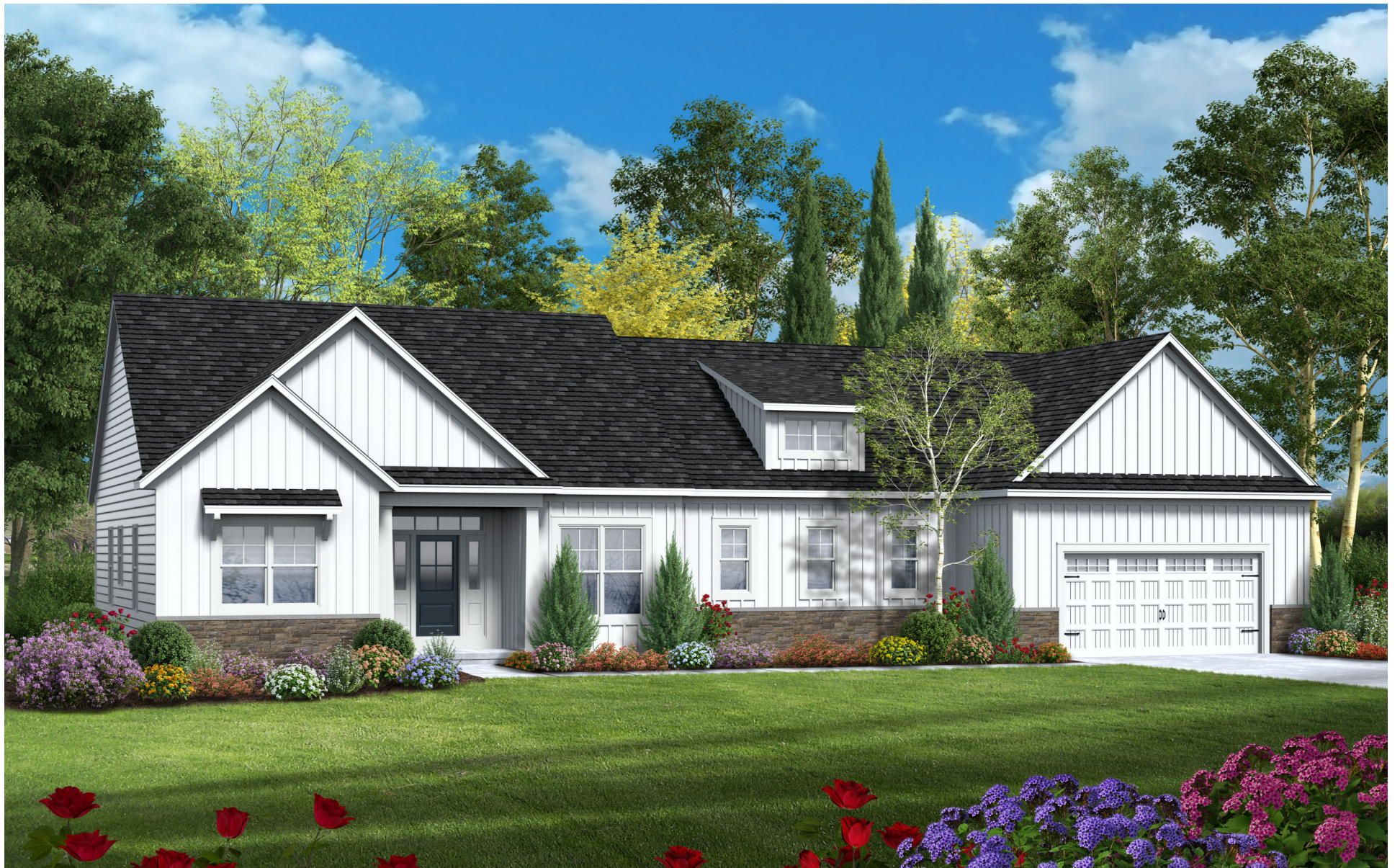
Ranch Portfolio Plan - 2,221