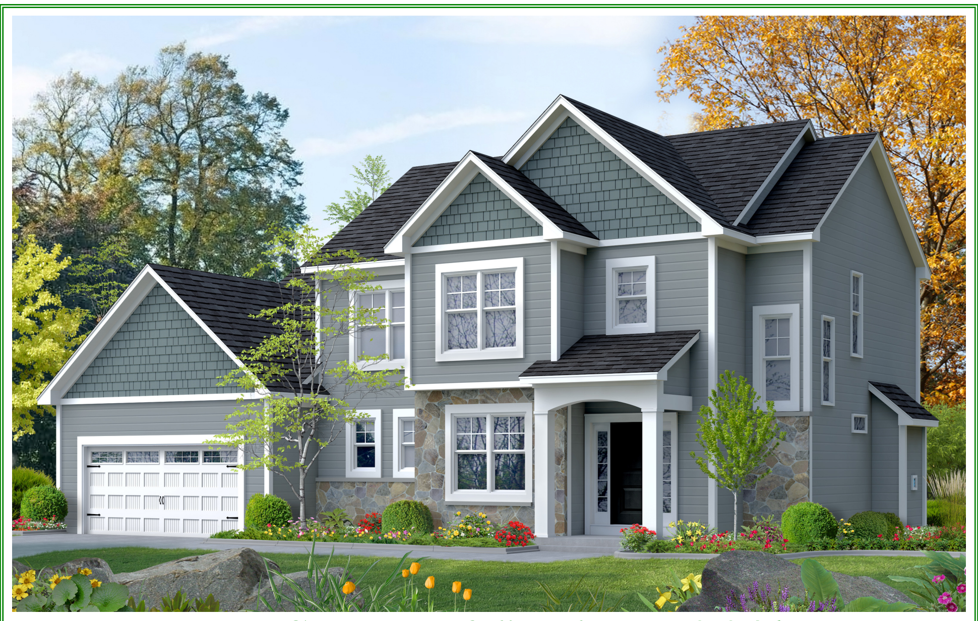
Two Story Portfolio Plan — 2,246