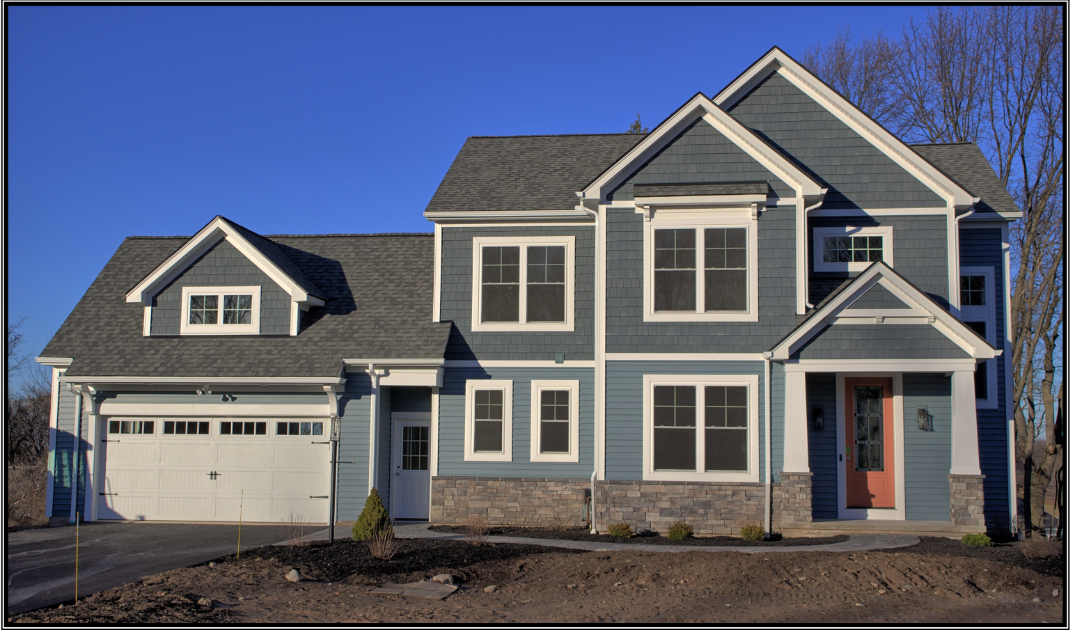
Lot 38 Stonington Ridge - Victor, NY