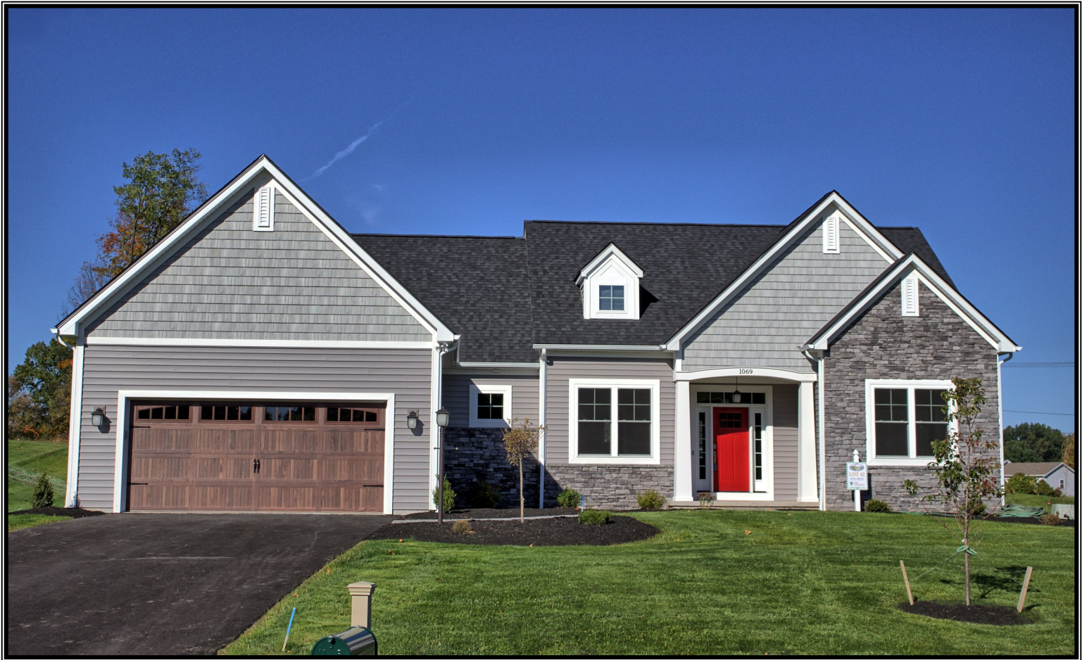
Lot 42 Stonington Ridge - Victor, NY