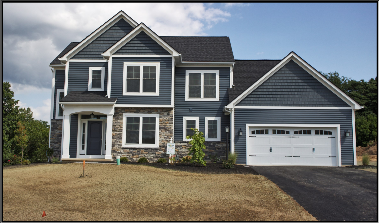
Lot 45 Stonington Ridge - Victor, NY