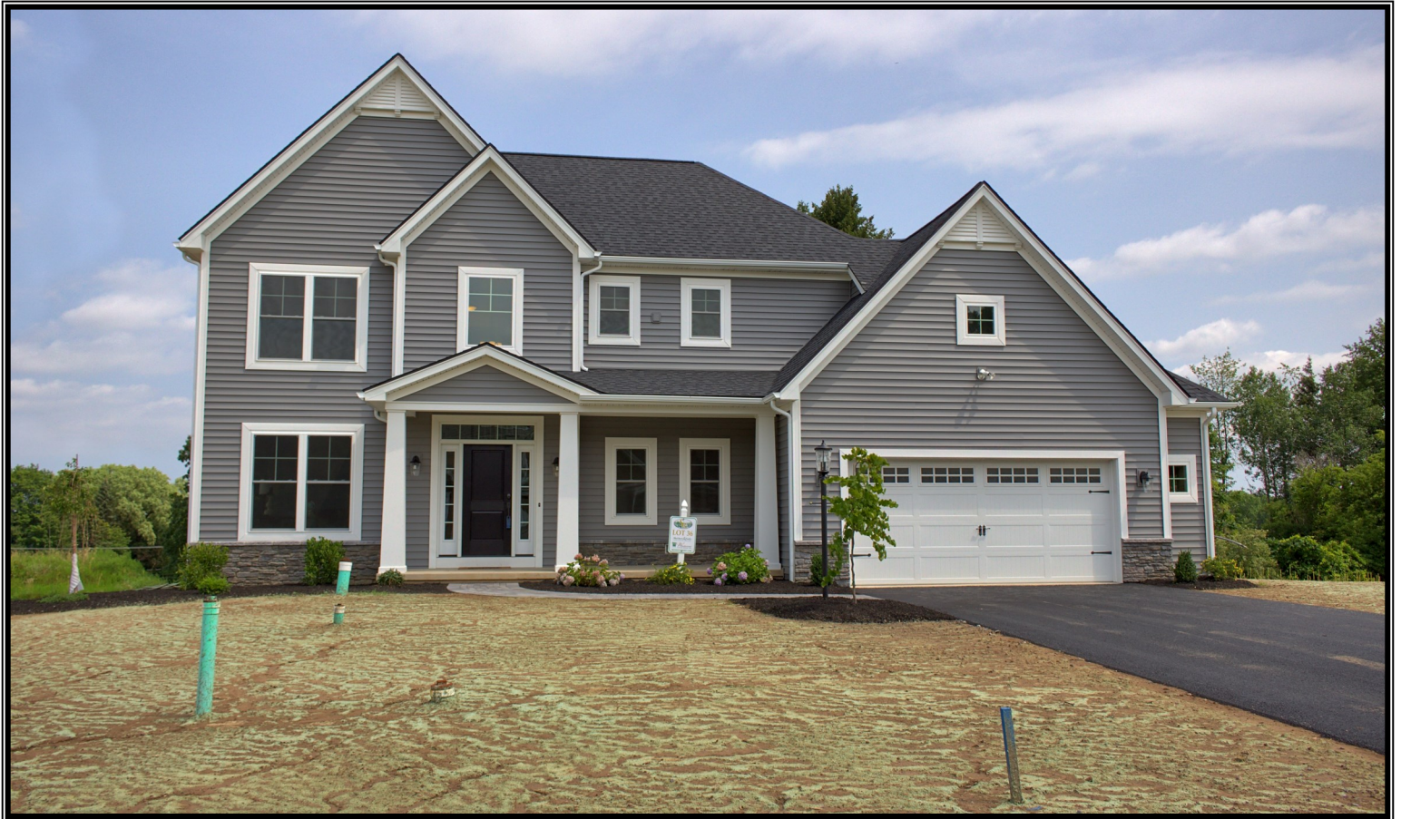
Lot 36 Stonington Ridge - Victor, NY