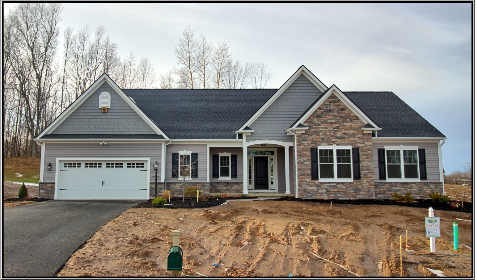
Lot 61 Stonington Ridge - Victor, NY