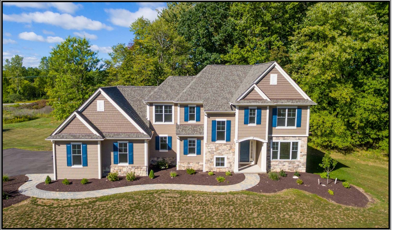
Lot 3 Arbor Glen - Victor, NY