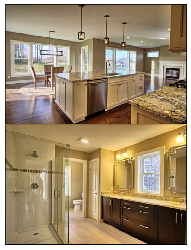
Woodstone Custom Homes, Inc. • 15 Fishers Road, Suite 114 • Pittsford, New York 14534 • www.woodstonenet.com