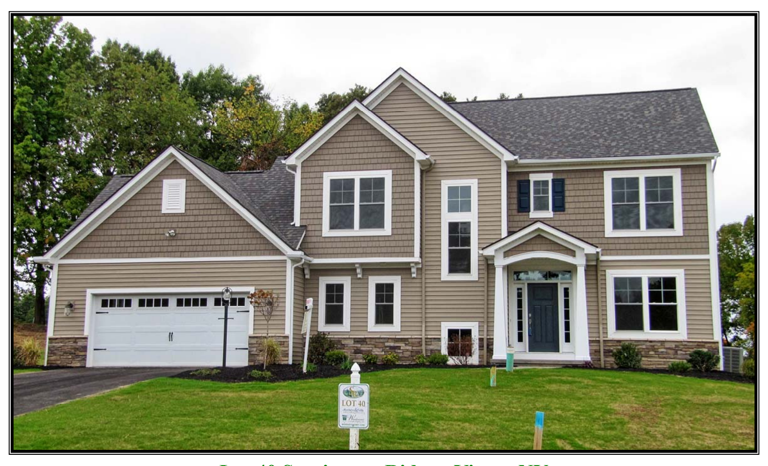
Lot 40 Stonington Ridge - Victor, NY