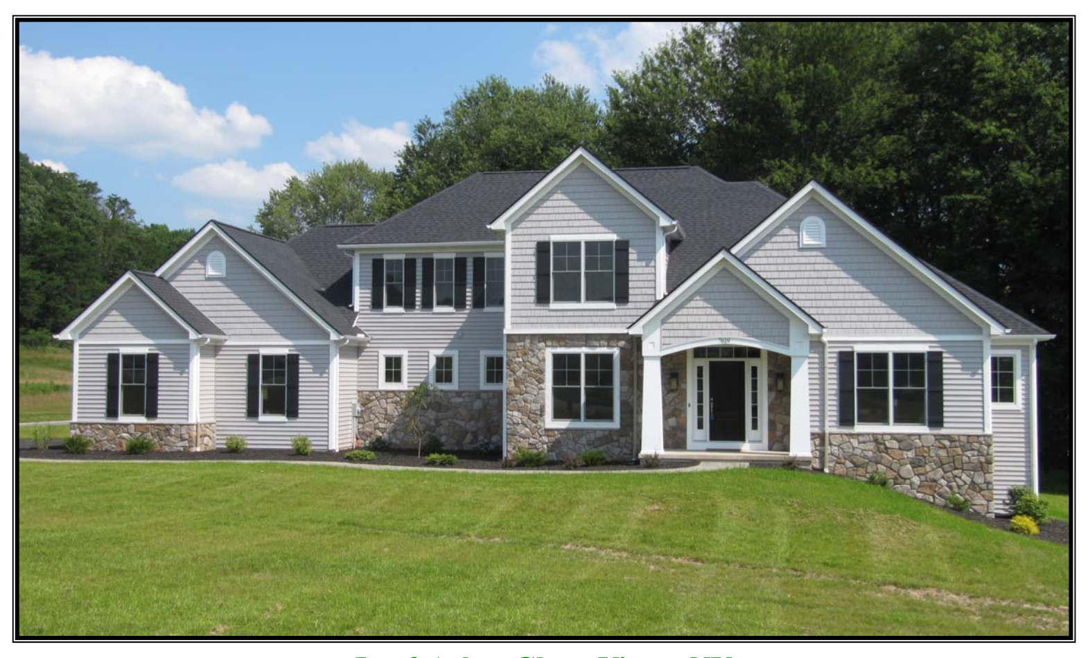
Lot 2 Arbor Glen - Victor, NY